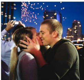
Our 1st NYE together